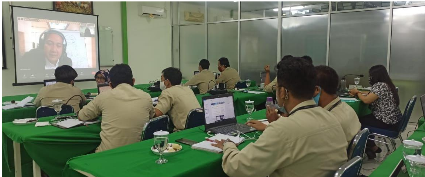
LOGISTIC MANAGEMENT PT. IFARS FARMACEUTICAL 23 SEPTEMBER 2020