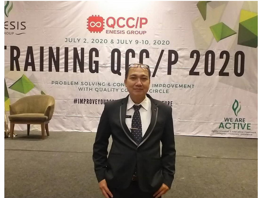
QCC PT. ENESIS GROUP