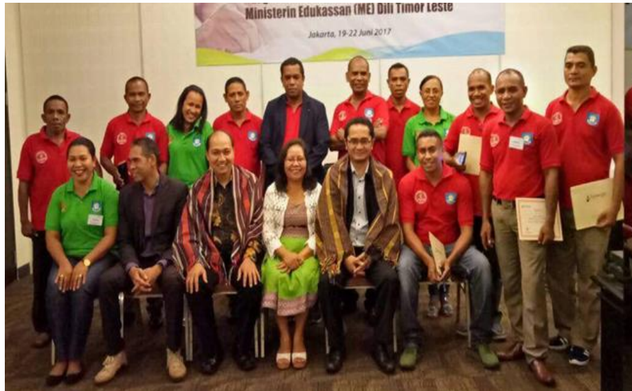
KEMETRIAN TIMUR LESTE