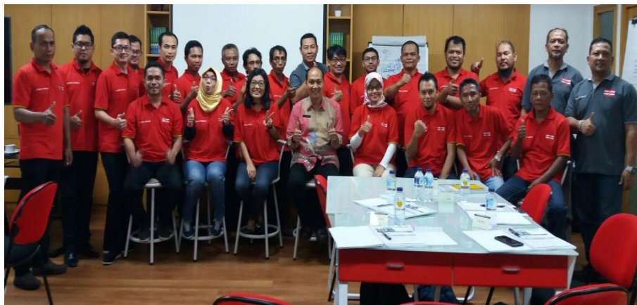
PT. SAMUDERA INDONESIA ( LOGISTIC )