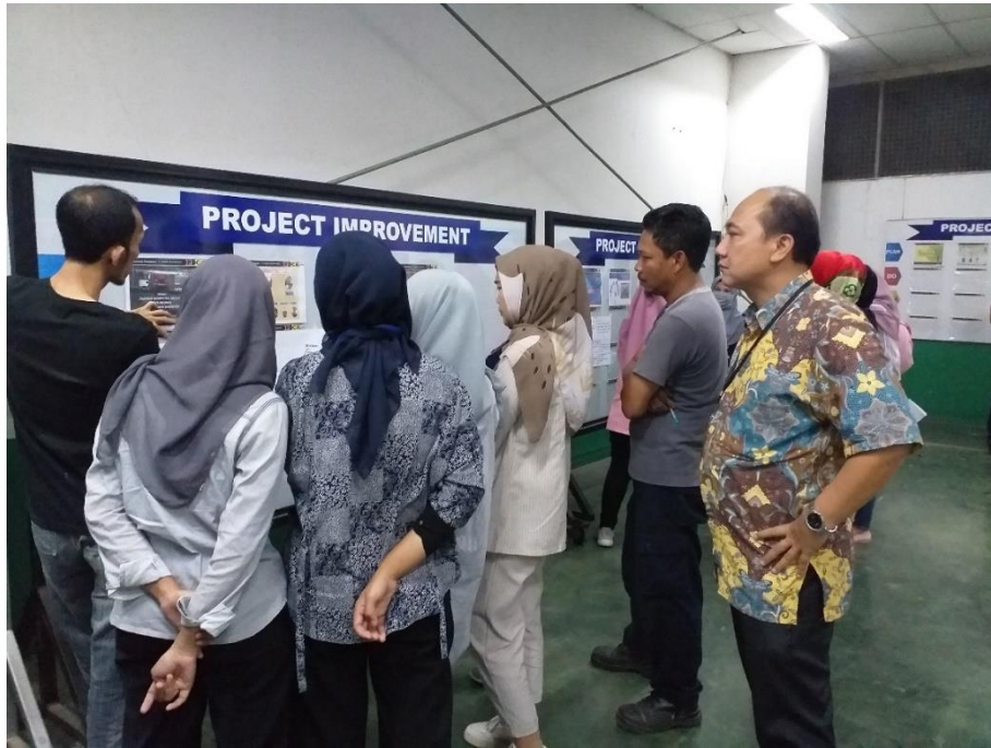
CONTINUOUS IMPROVEMENT PT. COSMO TECHNOLOGY