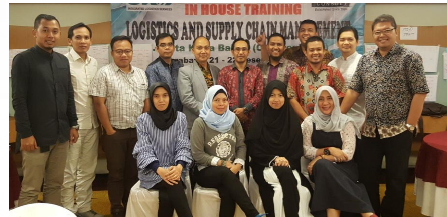
PT. CIPTA KRIDA BAHARI SURABAYA